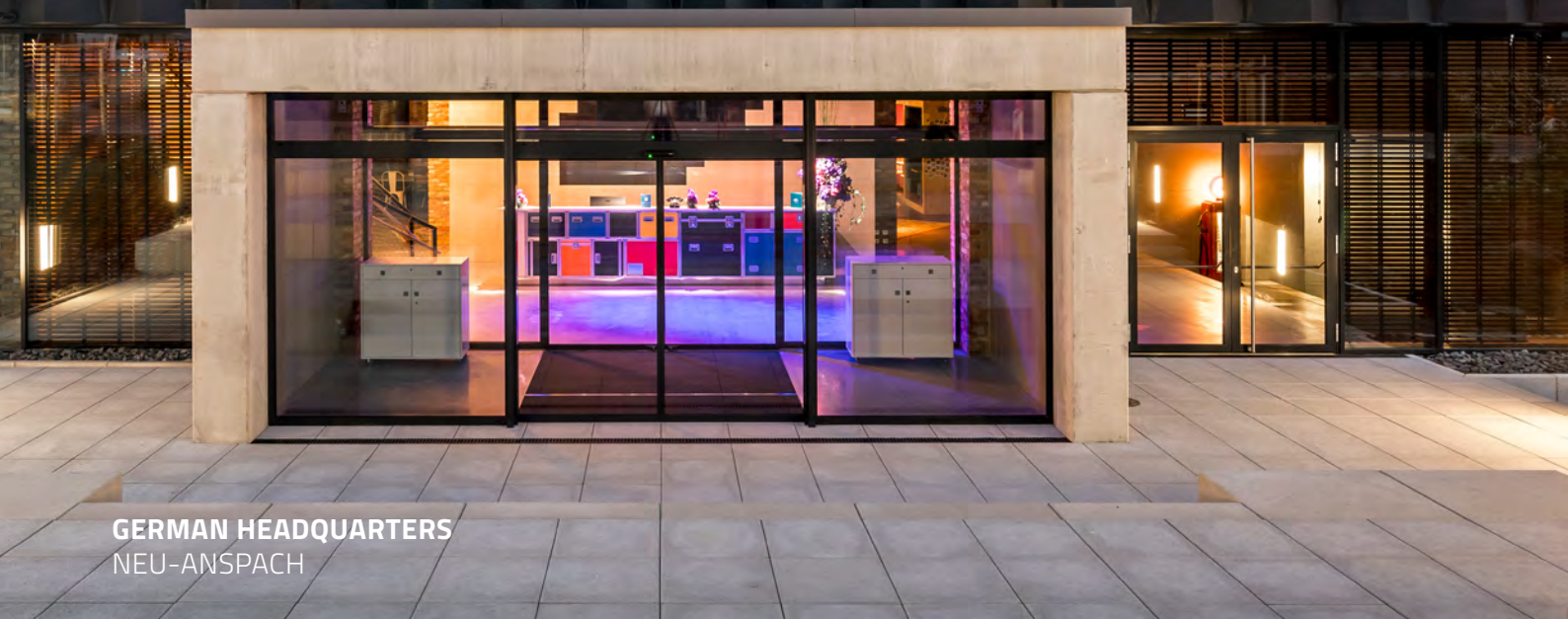
GERMAN HEADQUARTERS NEU-ANSPACH

The Adam Hall Group exports its brands and products to 111 countries worldwide, i.e. 56% of the global market, and is represented with showrooms for product presentation in Germany, Spain, the USA and the UK. Sales in China were added in 2020 and are being steadily expanded to strengthen the company's presence in Asia.