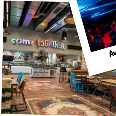
"Come Together" company restaurant