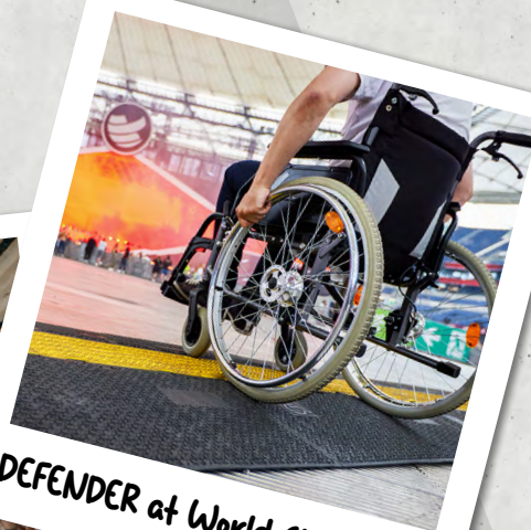
DEFENDER at World Club Dome