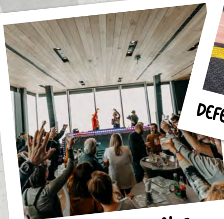
MAILA in the Alps