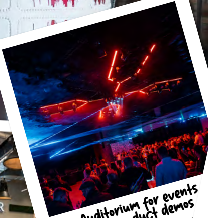
Auditorium for events and product demos