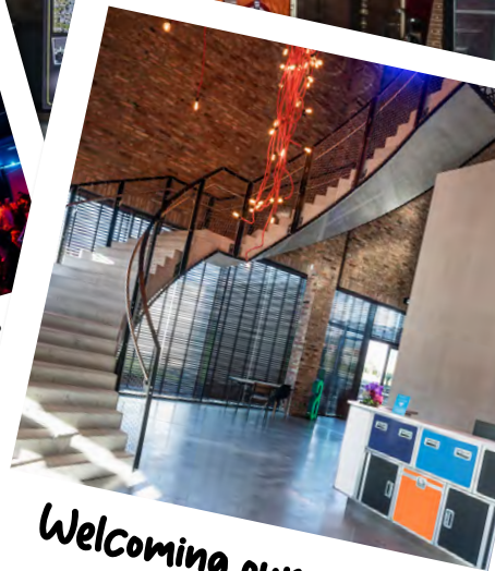
Welcoming our guests